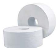
ORDER CODE: 7006 Livi Basics bathroom jumbo 2ply 300m