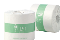
ORDER CODE: 7007 Livi Basics bathroom 1ply 1000s