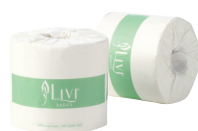
ORDER CODE: 7008 Livi Basics bathroom 2ply 400s