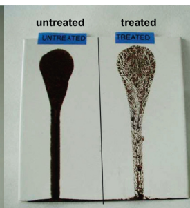
3) Tile placed vertically for 15 seconds.