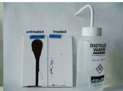
4) Rinsed with distilled water