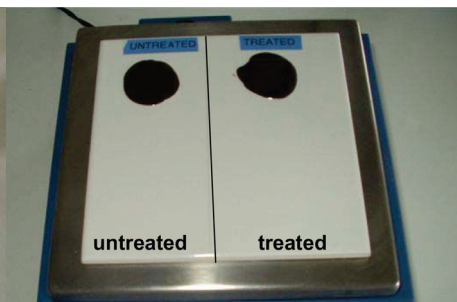
2) 1g of soil on each tile.