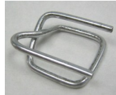
Wire Buckles for 12-19mm Polypro hand strap