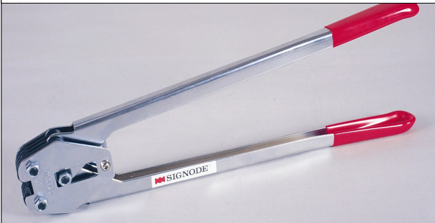
VS Sealers– Budget Range VS 12mm Light Duty Sealer – Code T7919A No spare parts available VS 15mm Light Duty Sealer – Code T7920A No spare parts available VS 19mm Light Duty Sealer – Code T7917A No spare parts available