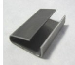
Open Flange Seal for Poly pro strap